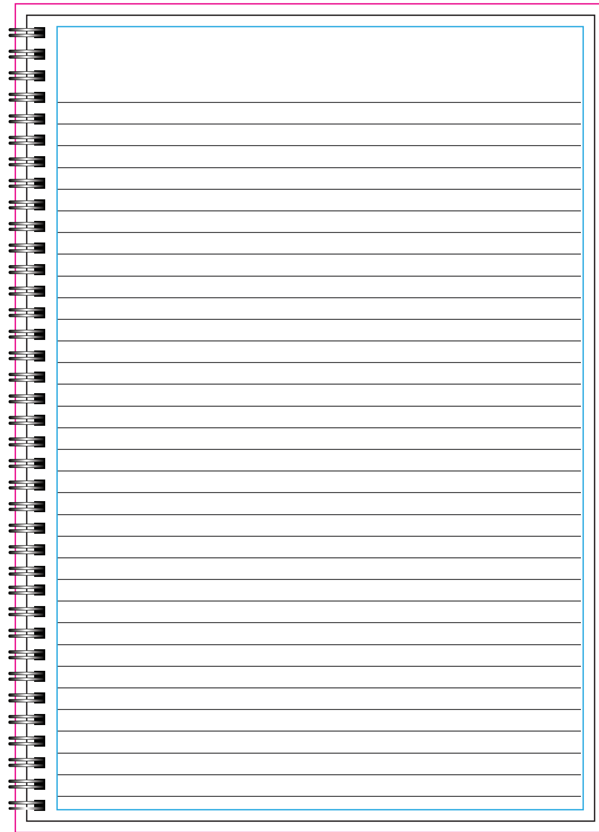
Inside Pages (Double Sided)